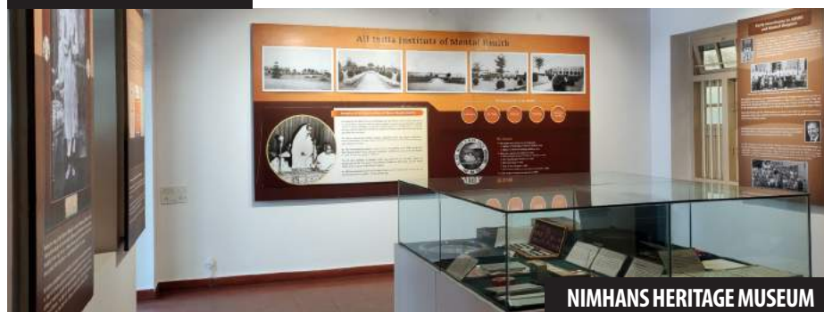
NIMHANS HERITAGE MUSEUM

Timings: 9.00 am-4.30 pm – Monday to Saturday