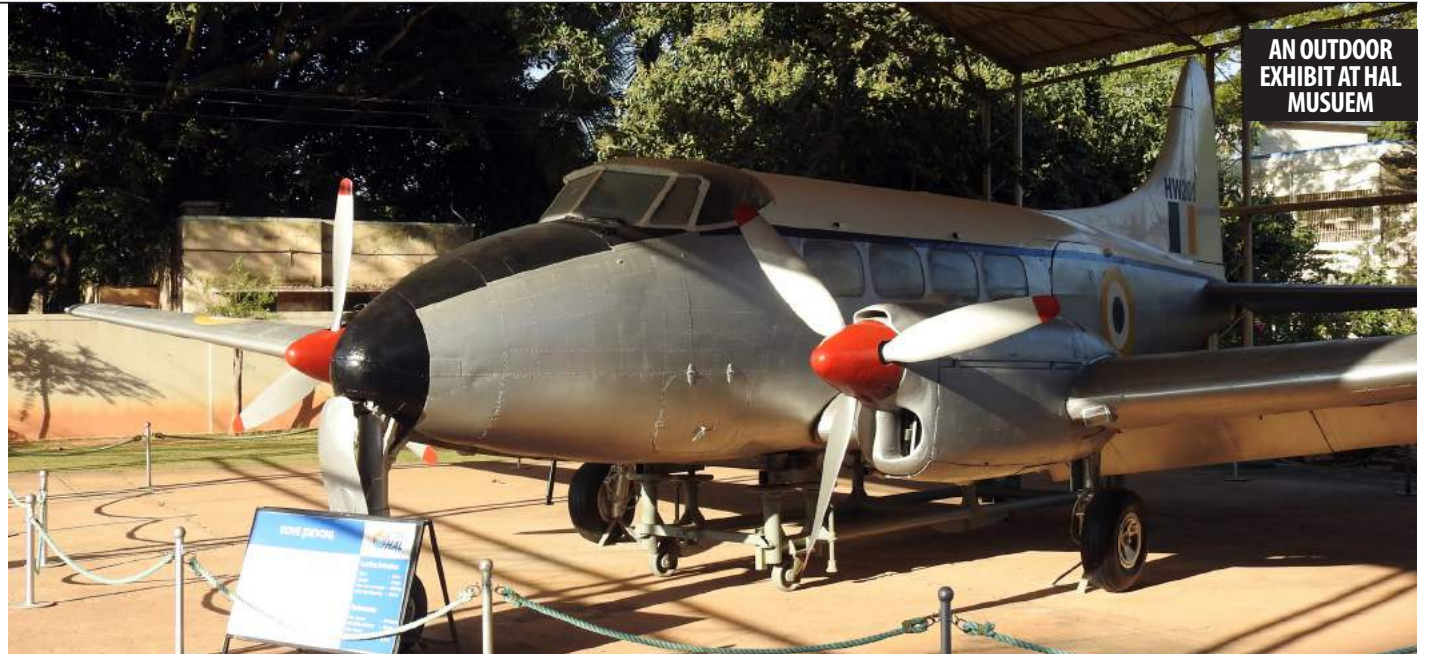
AN OUTDOOR EXHIBIT AT HAL MUSEUM

Located in the vicinity of Cubbon Park, the Visvesvaraya Industrial & Technological Museum is a government undertaking